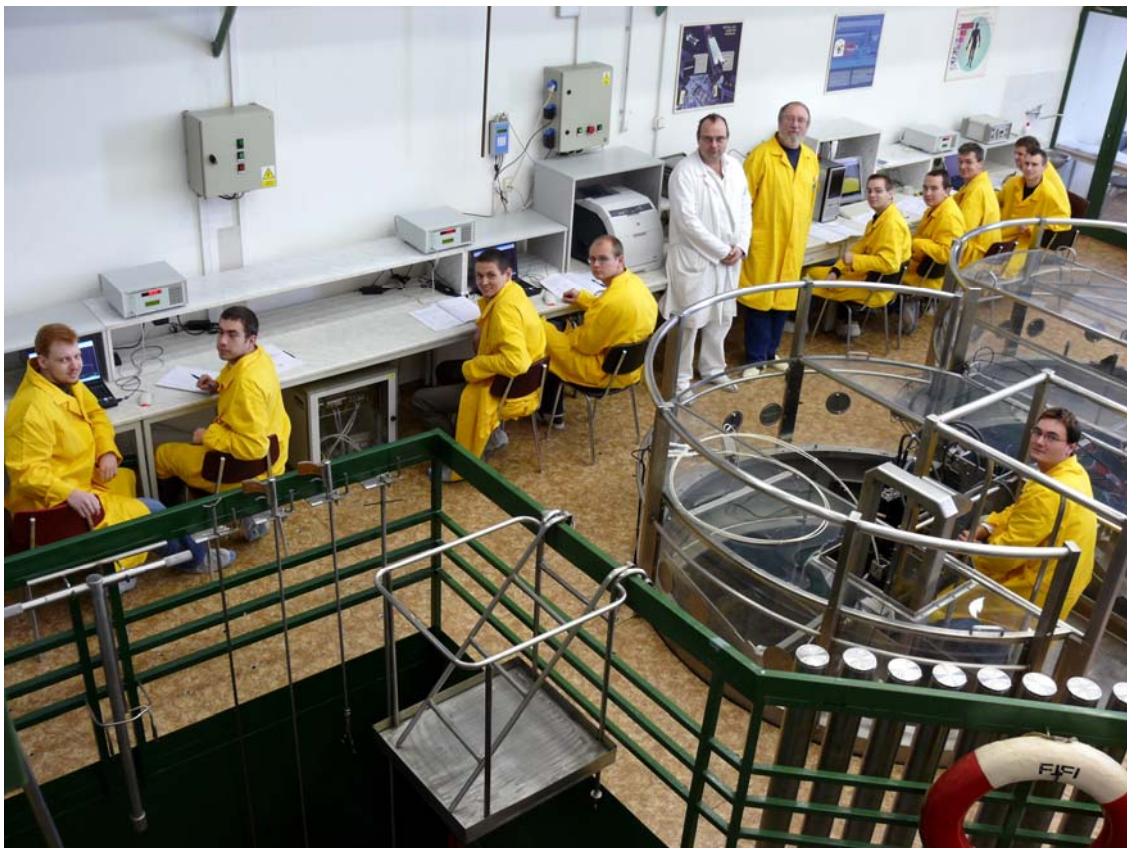
Fig. 2 Students at the VR-1 training reactor